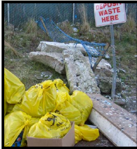
All other waste should go in the landfill at the marked area.