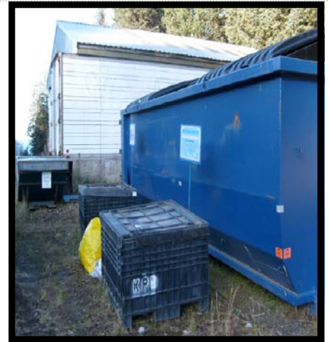
Remember to put your aluminum cans and plastic bottles in the proper recycling container.