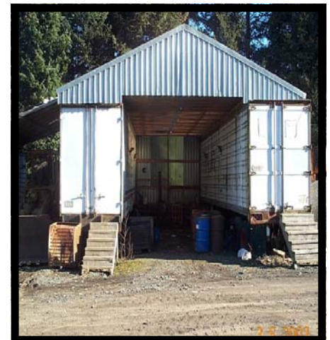
The designated area for oil is located between the two trailers. Totes are conveniently placed in this area for storage of used oil. Please dispose of fuel/oil in the buckets located in this area. Do not dump oil into the large holding tank.