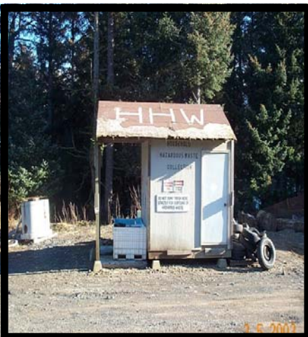
The Designated area for used batteries is located next to the Hazmat building. There are two totes placed here, one is for household batteries and the other is for auto and boat batteries.