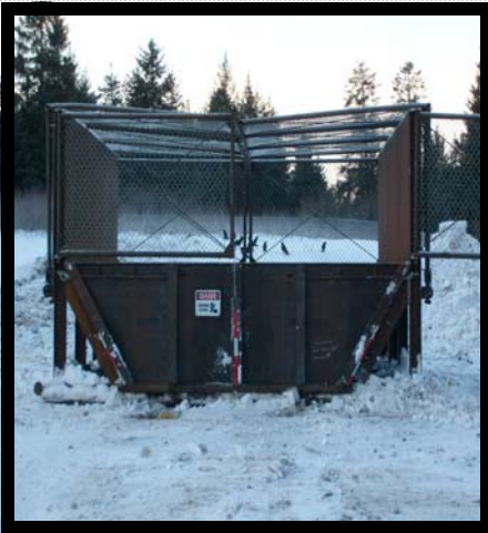
The burn box is for paper, cardboard, wood products only, Remember -NO STYRO-FOAM.

The Environmental Program has begun working on clearing and organizing the recycling area and the hazardous waste area. Please continue to deposit materials in the proper areas. Thanks to those who continue to sort their trash and recycle plastic bottles and aluminum cans.